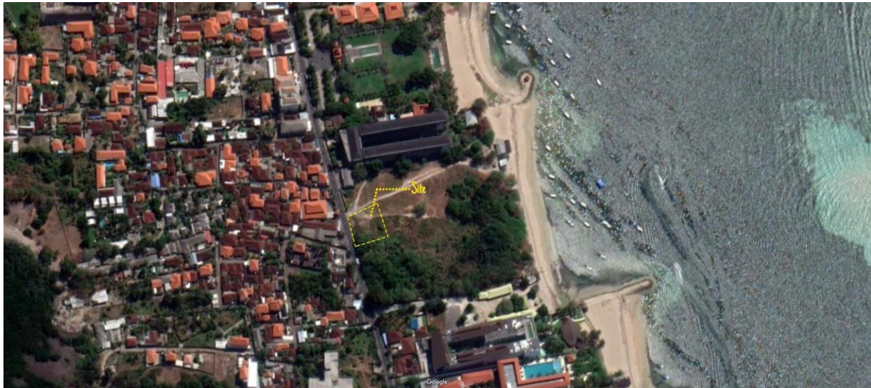
Fig: 5 – Site Plan

The site is located at one of its bustling neighborhoods in the Kaputen Badung suburban region southwards of Denpasar. The site has a major street frontage, with an area to access a lot of different kinds of water sports activities. The site has a beach view as well from the upper levels of the café.