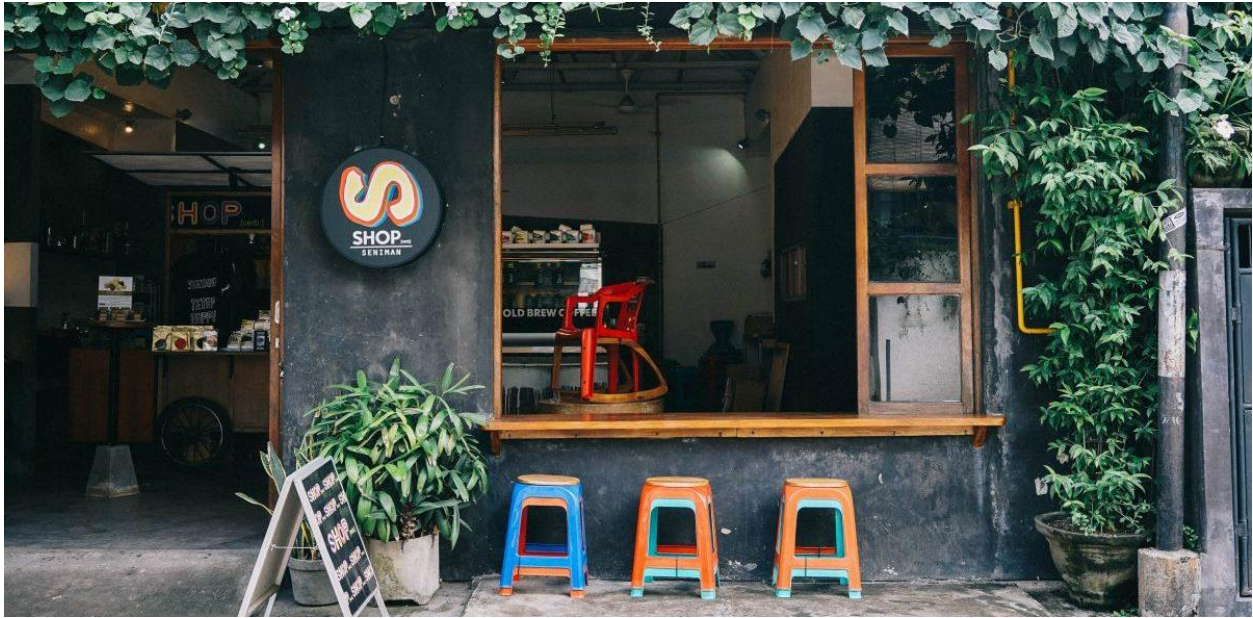
Fig: 3 – Seniman Coffee Ubud, Bali