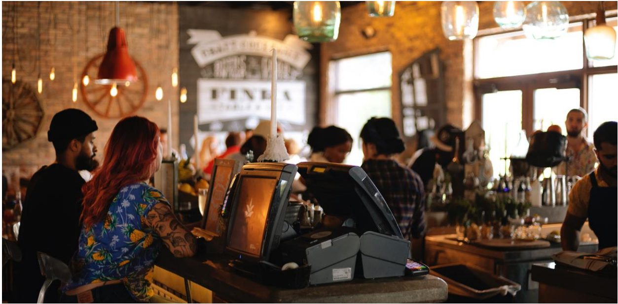
Fig: 2 – A bustling coffee shop today – An illustration