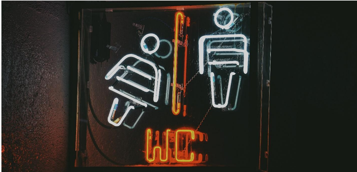
Fig: 1 – Toilets – Something we don't talk about but they are everywhere - An illustration