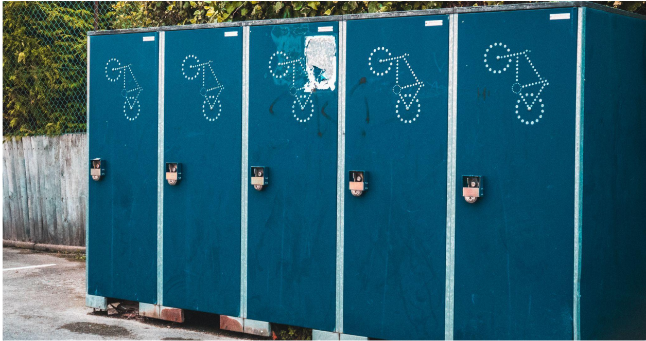
Fig: 3 – A modular toilet - An engineering solution